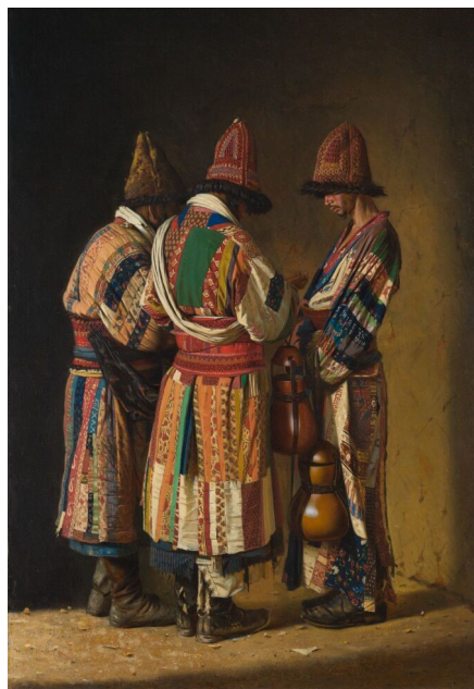
Fig.5. Vereshchagin V.V. Dervishes in festive outfits. Tashkent. 1870. State Tretyakov Gallery, Moscow

To a certain extent, materials on Central Asian dervishes provide clarification of the visual image of the Kazakh duana and its deeper understanding. Among the illustrative materials, the famous painting by V.V. Vereshchagin "Dervishes in festive attire" attracts attention. Vereshchagin's famous painting "Dervishes in festive attire. Tashkent" (1874). The painting depicts three praying dervishes (probably sheikhs or feasters). First of all, their costume attracts attention: a patchwork hirka dressing gown with a multicoloured belt with ornaments - kamar, a cone-shaped cap with fur trim - kulokh and a long white scarf - taylasan (Fig.5).