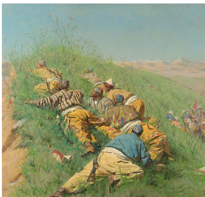
Fig.3. Vereshchagin V.V. Looking out. 1873. State Tretyakov Gallery, Moscow

Several copies of suede trousers belonging to the Kazakhs are kept in the REM (No. 8762-23497/1), the State Museum of Oriental Art and Kazakh funds. These trousers were decorated