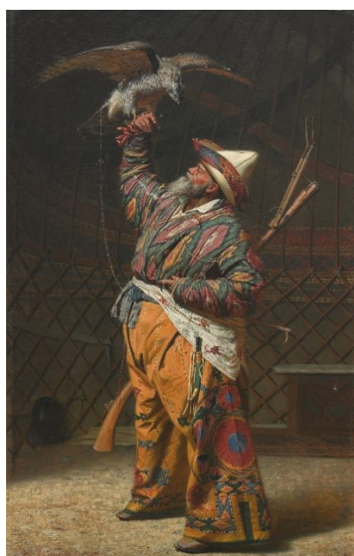
Fig.2. Vereshchagin V.V. Rich Kirghiz hunter with a falcon. 1871. State Tretyakov Gallery, Moscow

The analysed, Central Asian trousers were sewn from the finest suede of traditionally yellowish-ochre colour, originally produced by nomads and depicted in the paintings of V.V. Vereshchagin (Fig. 2-3). Later these shalbars were sewn from velvet and dense cotton fabrics. Samples of Kazakh shalbars with slightly different ornamental iconography than on suede ones are presented in the collection of the MAE RAS (No. 414-3 and No. 2528-1). Similar to the last two specimens are still produced by the Kazakhs of Xinjiang.